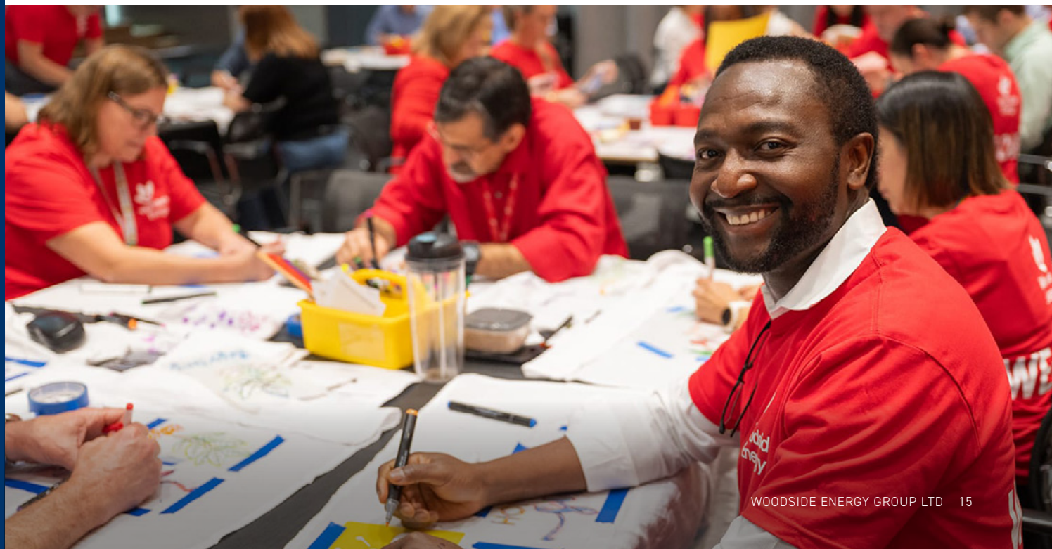
Pictured: United Way volunteers, Houston, USA.

Across the globe, more than 2600 employees—over 55% of our workforce—contributed 15,200 hours of work time to support community groups and nonprofit organisations.