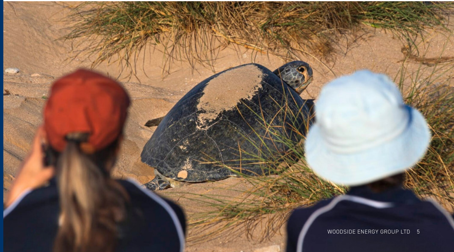
Pictured: Ningaloo Turtle Program, Western Australia.