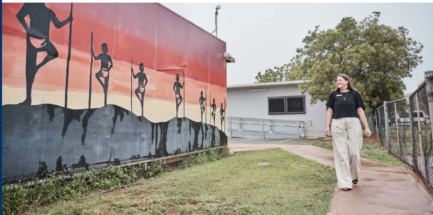
Pictured: Roebourne District High School, Western Australia.

152 teachers in the Pilbara region of Western Australia benefited from professional learning through the Karratha and Roebourne Education Initiative.