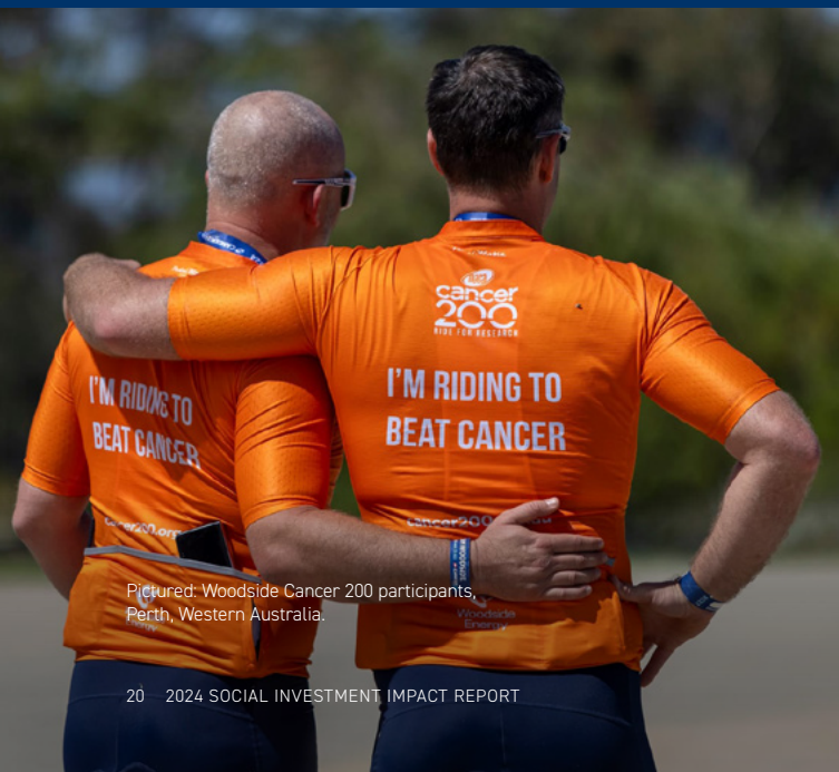
Pictured: Woodside Cancer 200 participants, Perth, Western Australia.

Woodside seeks to cultivate a workplace culture in which our employees are encouraged to give back to the community through volunteering and workplace giving programs.