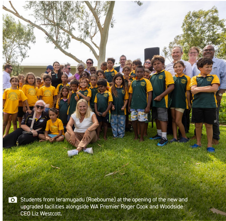
Students from Ieramugadu (Roebourne) at the opening of the new and upgraded facilities alongside WA Premier Roger Cook and Woodside CEO Liz Westcott.

"Education has always been central to that commitment in Roebourne, and these new facilities reflect what can be achieved when community, government and industry work together."