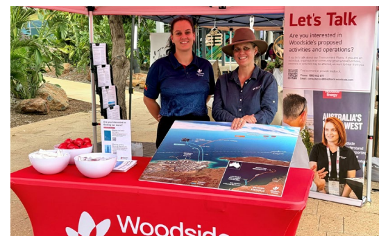
Highlights from the Red Earth Arts Festival (REAF) in Karratha, where Woodside employees enjoyed engaging with the community.