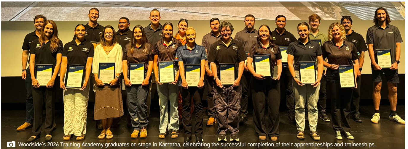
Woodside's 2026 Training Academy graduates on stage in Karratha, celebrating the successful completion of their apprenticeships and traineeships.

Woodside continues to invest in building local capability through its long-standing partnership with Programmed Training Services. Around 80 apprentices and trainees are currently hosted across the Australian business, developing skills and experience that will support the future of our operations in Western Australia.