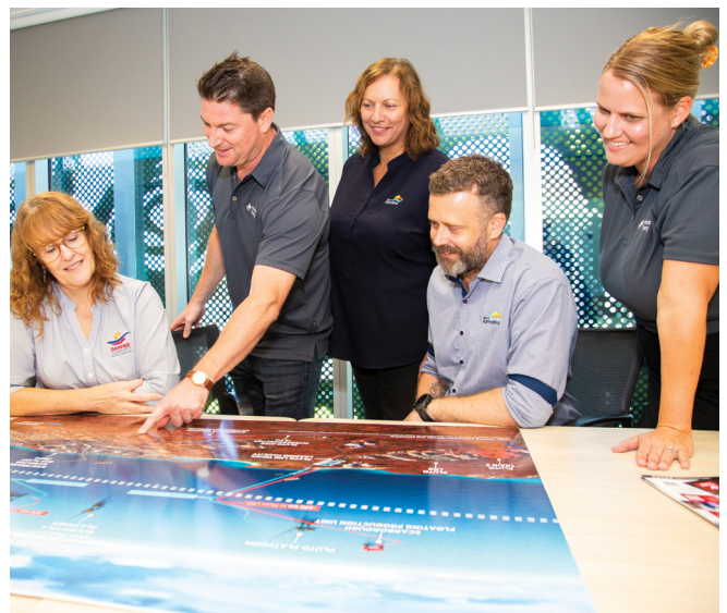
Woodside's CLG meet quarterly to share information, gather feedback and facilitate discussions.

If you're interested in finding out more about the CLG, contact us by email: northwestcommunities@woodside.com or keep an eye on our social media channels for updates.