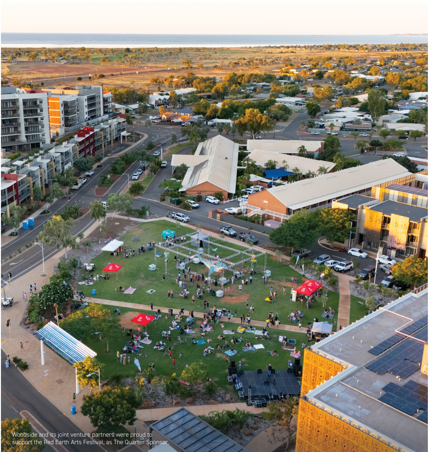
Woodside and its joint venture partners were proud to support the Red Earth Arts Festival, as The Quarter Sponsor.