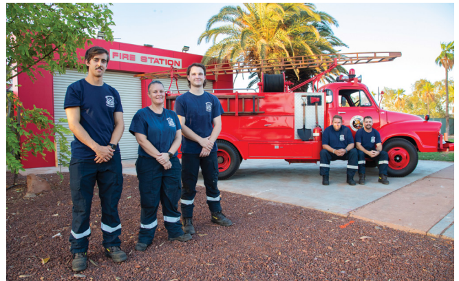
Karratha Volunteer Fire & Rescue Service were Woodside Community Grant recipients, 2024