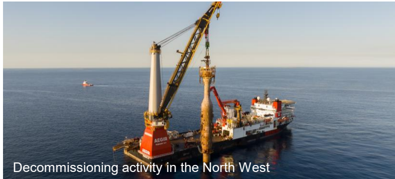
Decommissioning activity in the North West

Consultation Information Sheets are available on Woodside's website. You can also subscribe to receive updates on our consultation through our website .