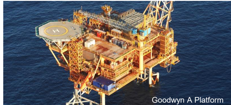
Goodwyn A Platform