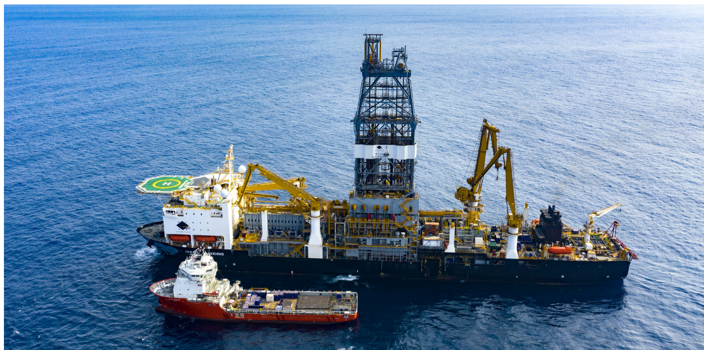
The Ocean Black Rhino Drillship with one of the supply vessels

Woodside remains on track to deliver first oil safely and on schedule targeted in 2023 and the project is expected to bring both economic and social benefits to Senegal.