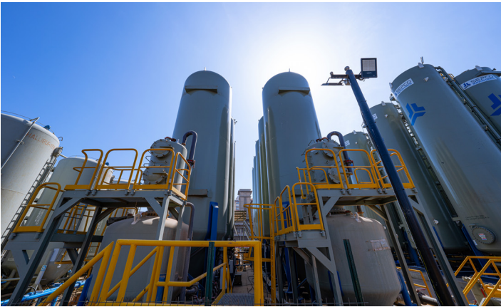
Liquide Mud Plant site - Halliburton

The development is expected to bring both economic and social benefits to Senegal through a broad set of new opportunities including employment, the procurement of local goods and services, local content skills transfer, training and capacity building, and social investment.