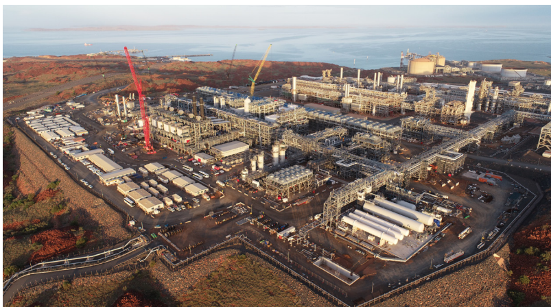
Figure 1 - Construction at Pluto Train 2 project site

Importantly for Western Australia, the Scarborough Energy Project can help to support local energy security by providing up to 225 TJ per day of domestic gas supply into the Western Australian market.