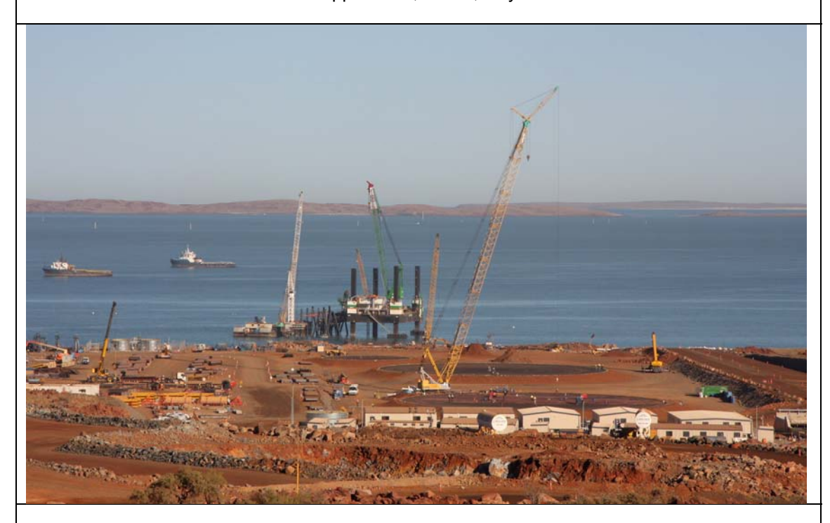
Plate 10: Site A construction, Jetty piling commenced after the completion of the Phase 1 dredging program, June 2008.