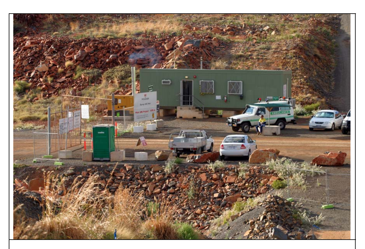
Plate 7: Pluto LNG Project construction site security gate (checkpoint to verify vehicle inspection for weed and seeds), July 2007.