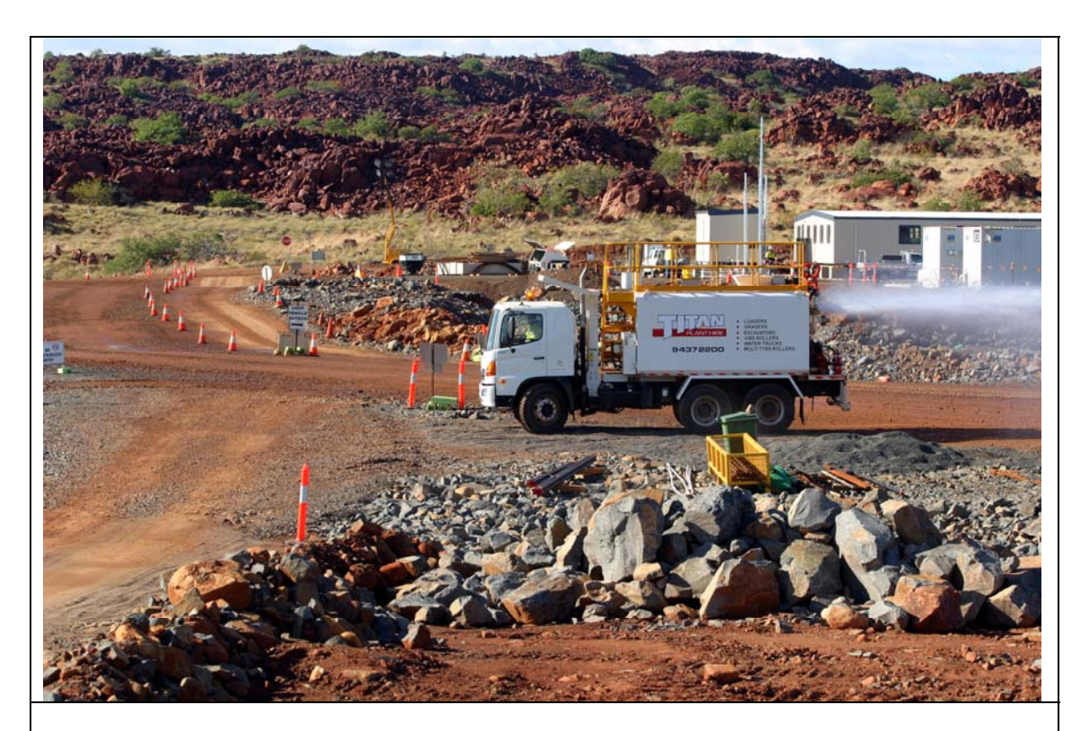
Plate 9: Water truck used for dust suppression, Site A, July 2008.