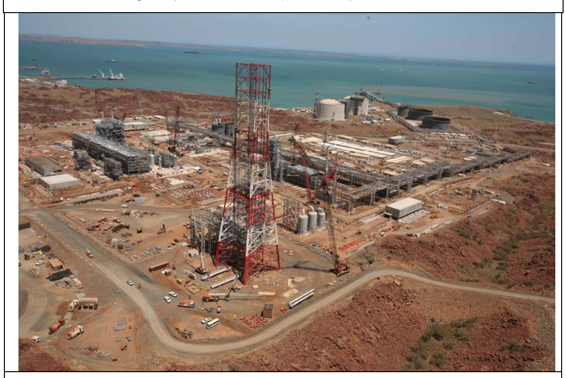
Plate 8: Flare tower construction, October 2009.