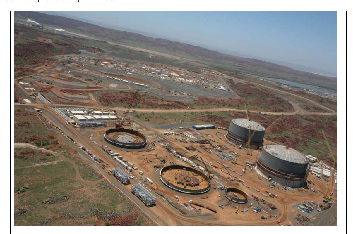
Plate 1: Pluto construction works have continued throughout 2009.