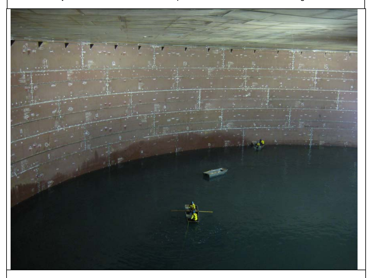
Plate 6: Hydrotesting of LNG Storage Tank 1, August 2009.