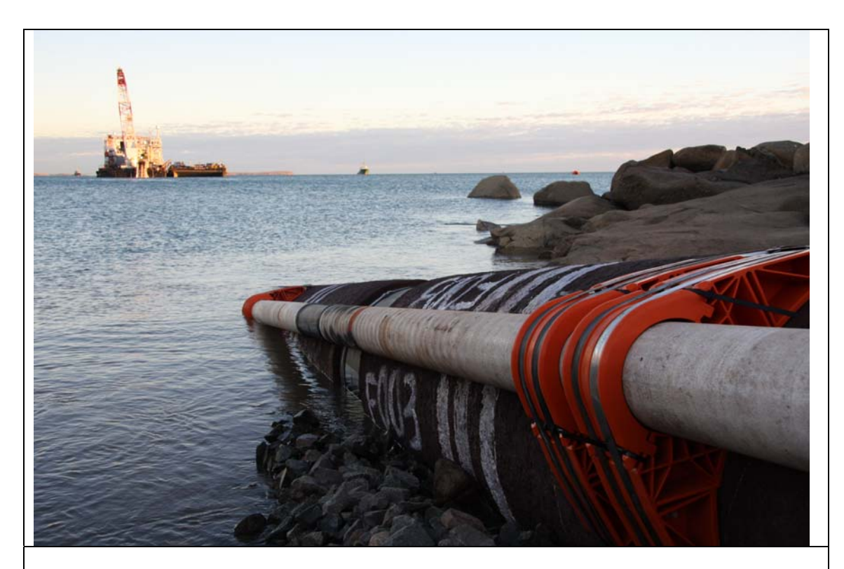
Plate 3: Pipeline shore pull, completed in May 2009.