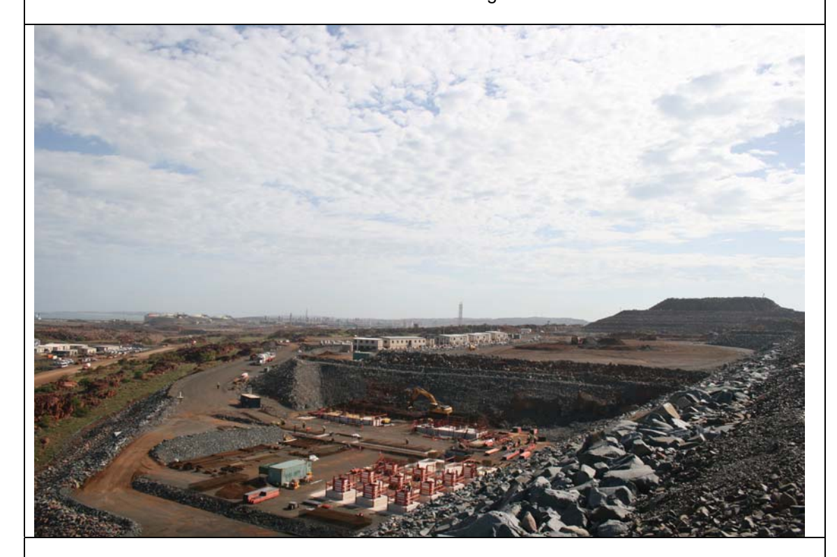
Plate 2: Site B preparation for liquefaction module arrival, February 2009.