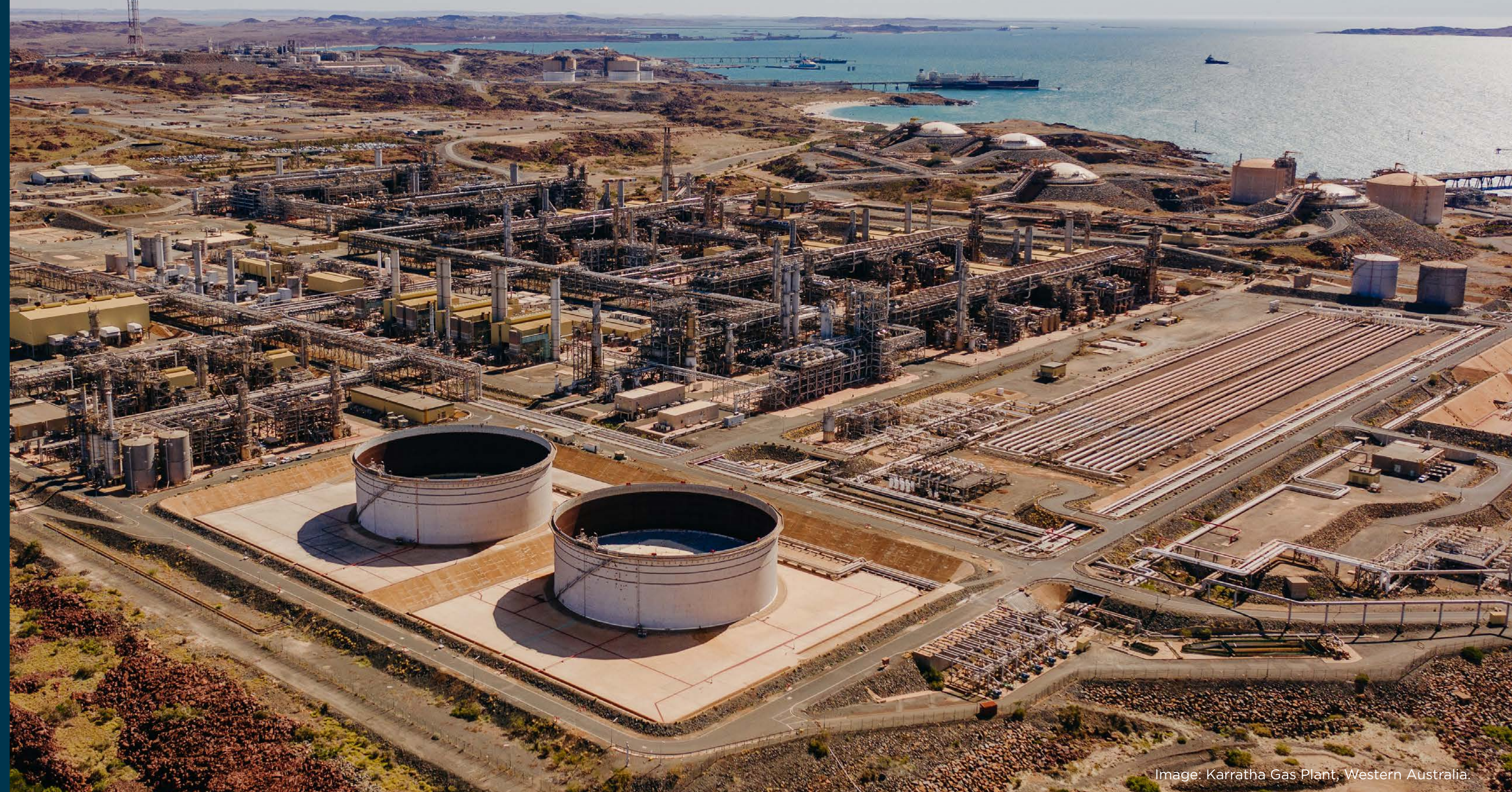
Image: Karratha Gas Plant, Western Australia.

The Pilbara is where our story starts. It is the heart of Woodside's operations. We have been in the region for more than three decades and have seen and contributed to the growth of Karratha.