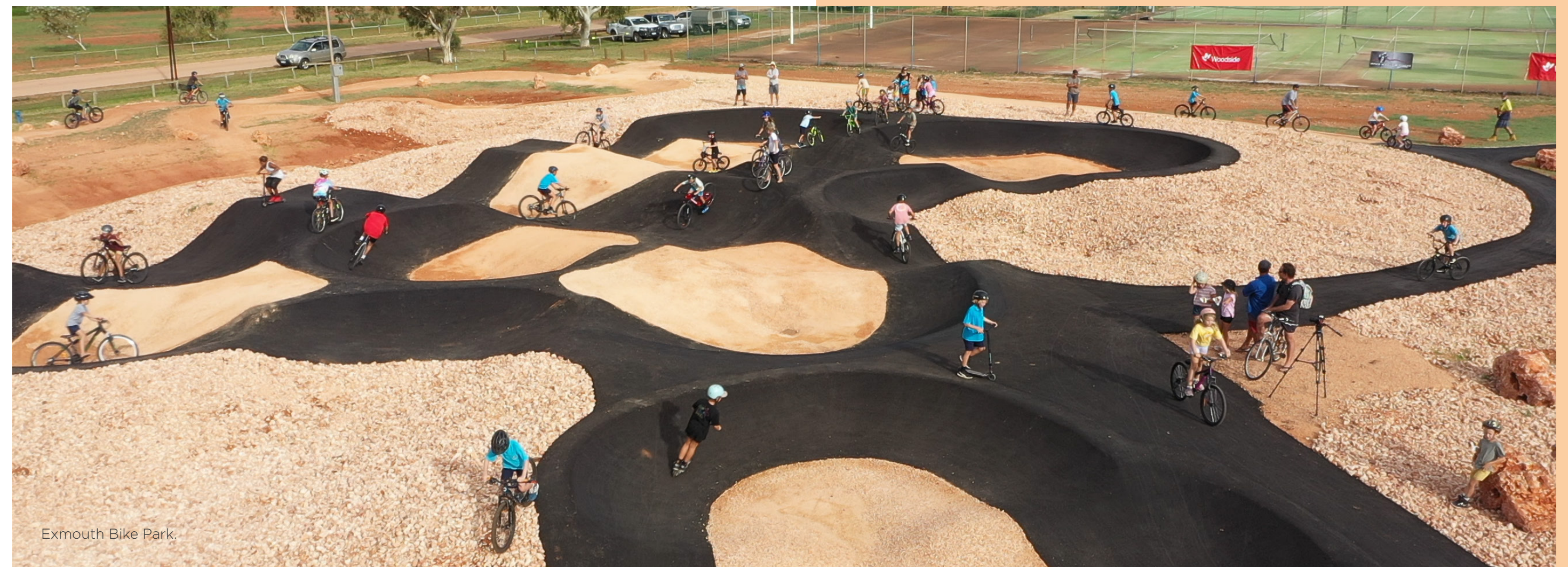
Exmouth Bike Park.