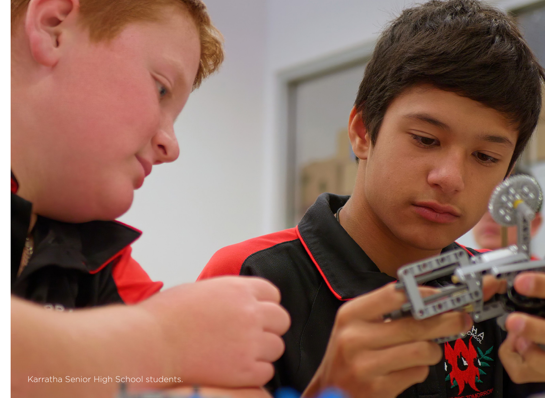
Karratha Senior High School students.

Initially designed to bridge the gap between the opportunities and resources available to students in Perth and those residing in the Pilbara, the partnership has evolved over more than a decade to support students on their pathway to employment. The KEI also assists in the attraction and retention of quality teachers for the region through the delivery of professional learnings and development, building teacher expertise, experience and capability.