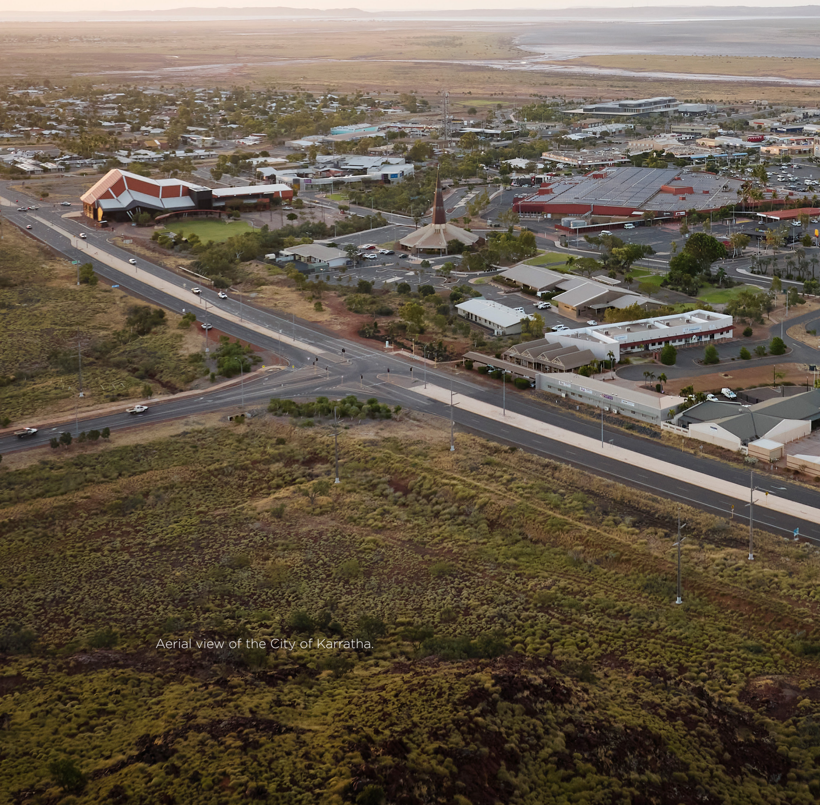
Aerial view of the City of Karratha.