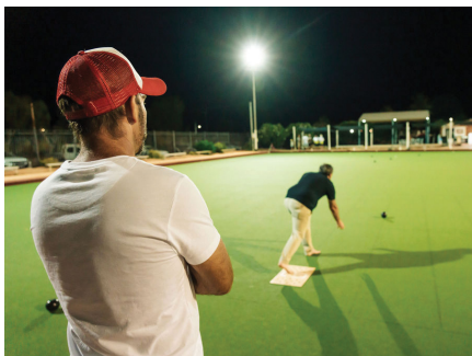
Community partners playing a friendly game of lawn bowls during the sundowner event