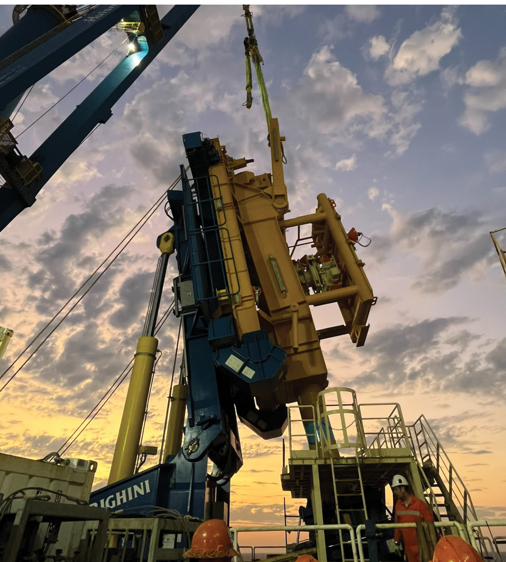
Several of the Scarborough Energy Project EPs were accepted in late 2023, including trunkline installation, with the work completed in October 2024

Woodside's Commonwealth EPs, currently under assessment and EPs that have been accepted can be viewed on NOPSEMA's website.