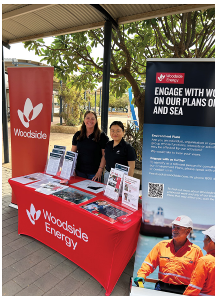
Woodside Energy staff ready to chat at Ross St Mall