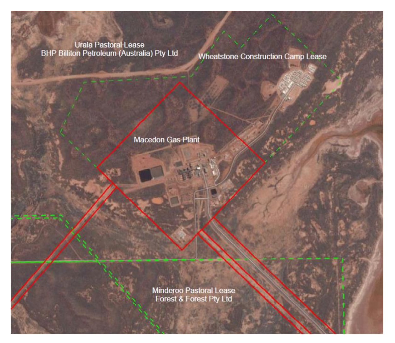
Figure 2: Macedon Gas Plant Lease (red line) and Layout