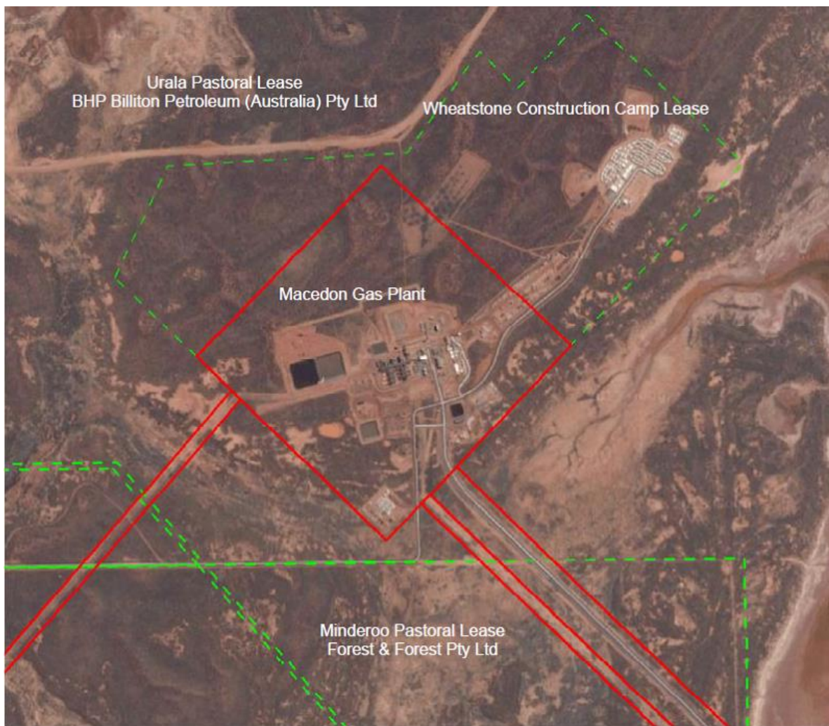
Figure 2: Macedon Gas Plant Lease (red line) and Layout