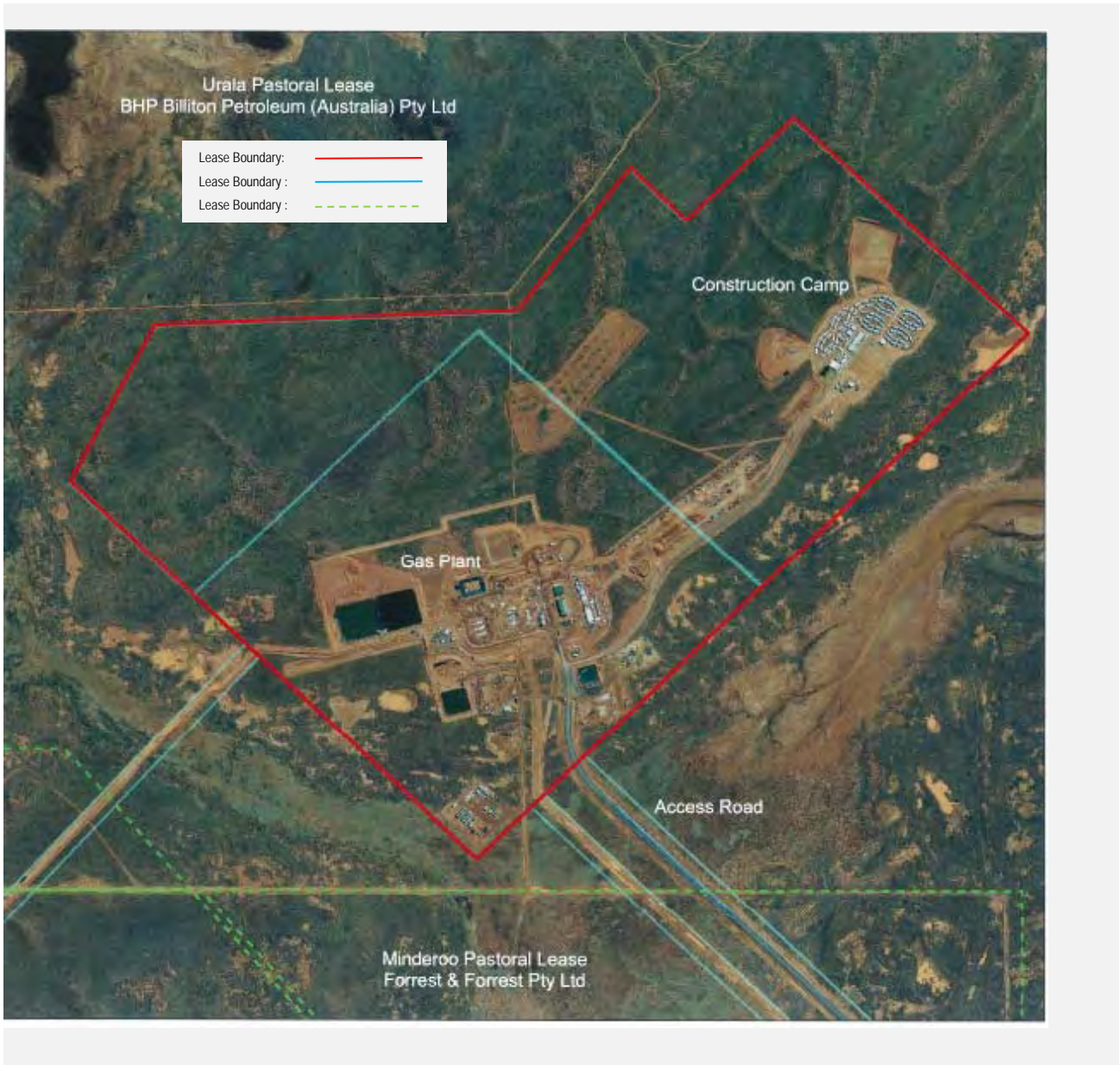
Figure 2 Macedon Gas Plant Lease and Layout